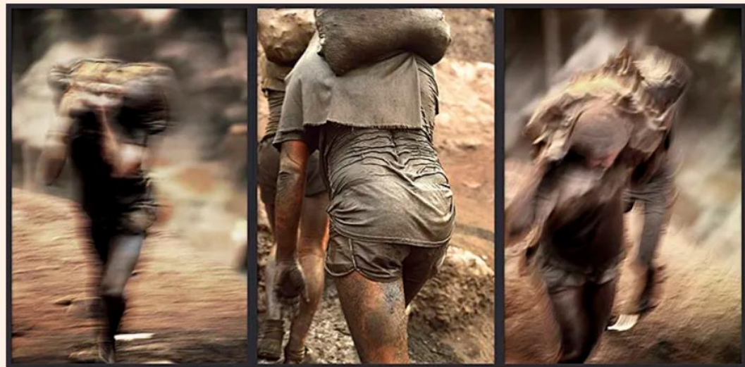
Alfredo Jaar's 'Gold in the Morning' (1985/2018)

The collector behind the Pérez Art Museum Miami has opened a space in the city's up-and-coming Allapattah area