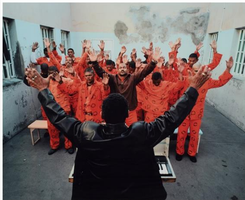
Sunday Service, Beaufort West Prison, 2006, Mikhael Subotzky (Photo courtesy of El Espacio 23)

The African Diaspora refers to the many communities of people of African descent dispersed throughout the world as a result of historic movements, much of it from forced migrations due to slavery.