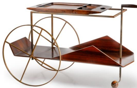
Tea Cart by Jorge Zalszupin.