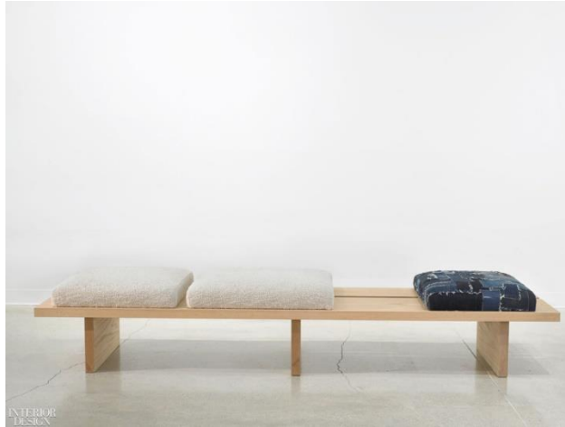
Heroes Bench by Vivian Carbonell. Photography courtesy of Carbonell Design Studio.

made of charred hand-carved almendro wood, and the delightful Cabezón table lamp, composed of polished gypsum plaster and mahogany block. Rodríguez's handmade furniture and objects are made in small, limited-edition series. Moore Building 191 NE 40th St, Miami, FL 33137