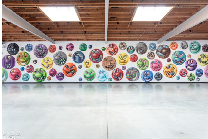
Kenny Sharf: Moodz.”