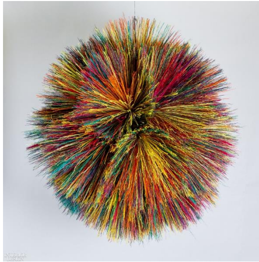
Broom Thing by Stephen Burks in collaboration with Berea College Student Craft.

Among the standouts of a historic collection of furniture, ceramics, and wood- and metalworks presented by Moderne Gallery in its exhibition of pieces from the American Studio Craft Movement at the Design Miami/Podium exhibition is a restrained sculptural bench by midcentury master George Nakashima. The distinctive custom piece was made for St. Paul's Abbey of Newtown, N.J., sometime between 1962 and 1964, when Nakashima designed a series of unique furnishings made specifically for the Abbey. Moore Building 191 NE 40th St, Miami, FL 33137