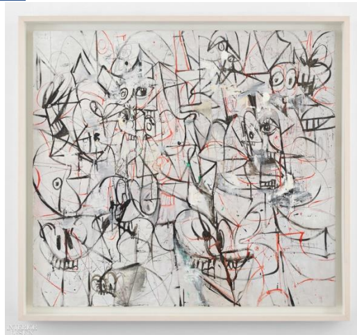
Red & Black Thought by George Condo.

Works on display at the Jason Jacques Gallery in the Design Miami/Podium exhibition include both manmade and natural wonders. "Wishbone," a monumental freestanding sculpture carved from a single piece of ancient redwood heartwood in the 1980s by American sculptor J.B. Blunk, was crafted with minimal transformation to the material in order to keep the memory of the living tree intact. The monolithic sculpture contrasts with two nearly complete Camptosaurus and Allosaurus dinosaur skeletons excavated in Wyoming and presented by the same gallery. Moore Building 191 NE 40th St, Miami, FL 33137