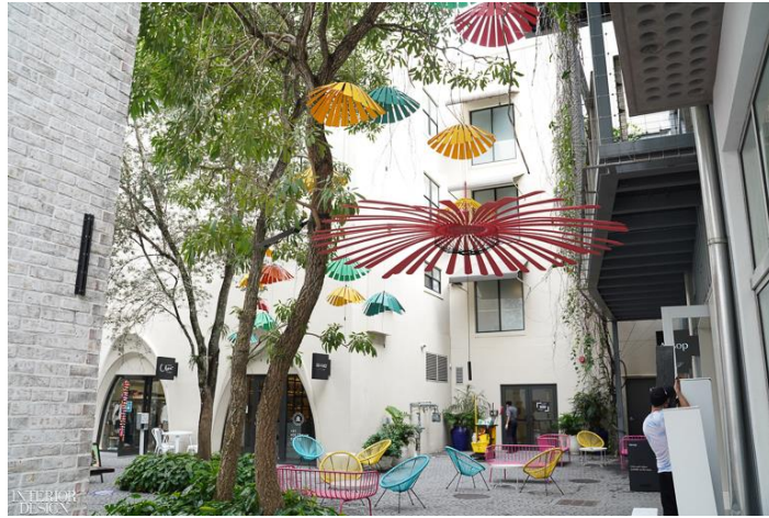
Conscious Actions was a series of interactive installations throughout Design District.