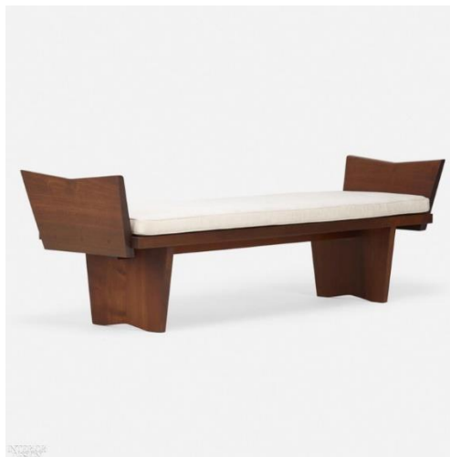
Bench by George Nakashima.